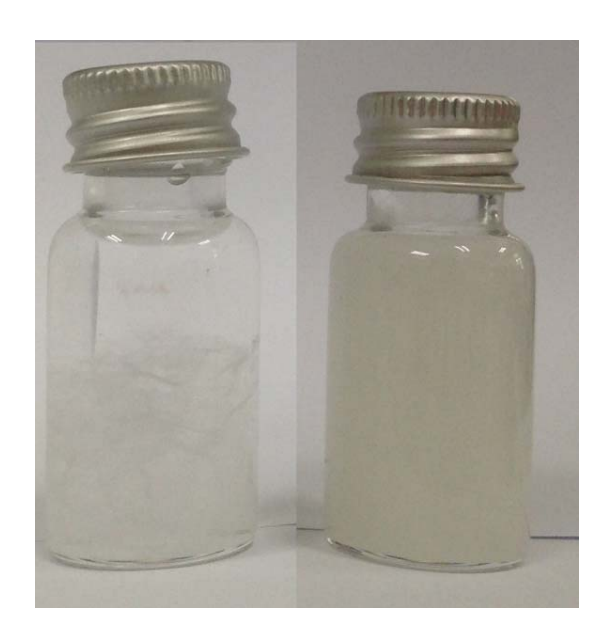
(A) (B) Figure 1. Suspensions of (A) bamboo fibers and (B) MFC fibrils after 60 minutes treatment time.

1 wt% cellulose suspensions of untreated bamboo fiber and 60 minutes-treated bamboo fibers are shown in Figure 1. The raw bamboo fibers were precipitated at the bottom of the bottle after mixing with distilled water. However, no sedimentation of fibrils mechanically treated for 60 minutes can be observed after 24 hours. This indicates the higher degree of fibrillation and more surface area of MFC fibrils can be obtained. (9,21) The similar behavior has been found from aqueous suspensions of cellulose nanofibers pre-treated using high pressure homogenization sonication (9,21